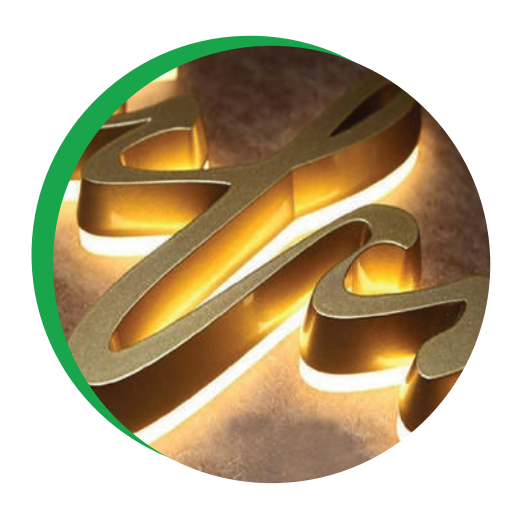
3D Art Work

Unique, eye-catching three-dimensional designs.