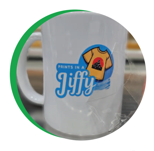
UV DTF Work

Direct-to-film printing for apparel and other surfaces.